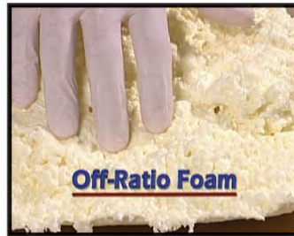
More "B" chemical is being dispensed

If the valve is completely open, and there is chemical in the tank, the problem may be in the gun. Did you use the kit before? How long ago? Moisture can cause small crystals to form in the A-Component hoses. If crystals have formed, they are loosened when you pull the trigger and can clog the A-Component half of the gun, decreasing or completely blocking the flow. If the system is used a MINIMUM of once a week, crystals do not have a chance to form. The kit should not be allowed to sit unused for more than seven (7) days at a time, otherwise crystallization will occur. If the A-Component half of the gun becomes blocked, it will be necessary to purchase another gun/hose assembly to continue to use the kit.