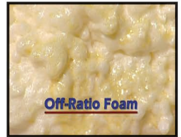
More "A" chemical is being dispensed

If you see more "A" chemical than "B" chemical (more dark than light), the foam dispensed is probably darker in color and crunchy to the touch. First check the temperature strip. If the indicator is near to the blue section, or fully in the blue section, the chemicals are too cold. Place the tanks in a heated area or in a warm water bath until the green portion of the temperature strip is highlighted in red. This indicates that the chemicals are at the proper temperature for use. Shake vigorously prior to use and perform another test shot.